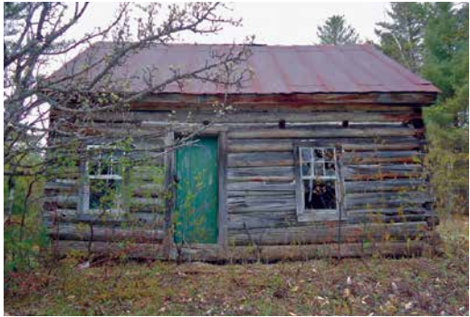
A. P. Morse house, Minerva, c. 1814

Trees were initially used for construction in their elemental form—as logs and branches—not for any aesthetic reason but because it was easiest. Logs could be cut, cleaned of branches, notched and stacked using only an axe and manpower. Three methods of log construction were used in the Adirondacks: stacked log construction, vertical log construction, and structural framing with logs. Settlers typically used horizontally stacked logs, with