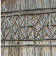
Cedar Bark Siding