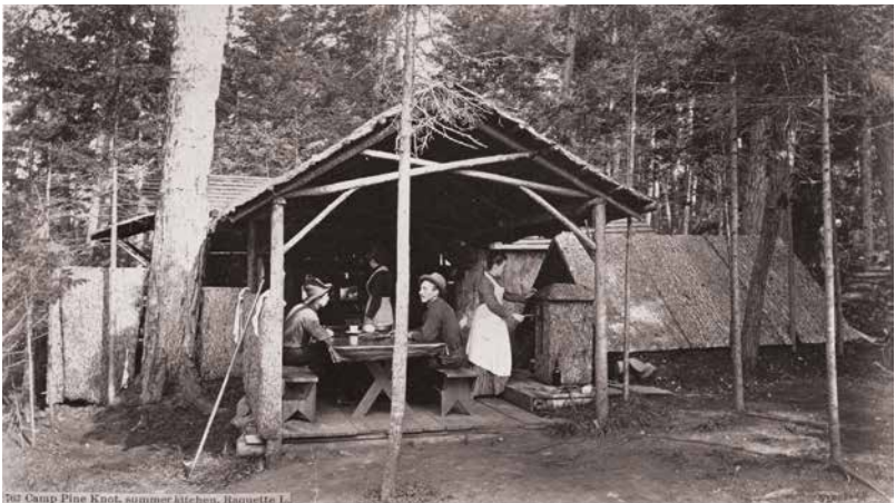
Pine Knot summer kitchen with sapling frame and bark roofing, S. R. Stoddard, c. 1880

Standing logs on end side by side to form solid walls, known as palisade construction, was far less common than stacking. This method was likely introduced to the Adirondacks by lumberjacks from Quebec who immigrated in substantial numbers in the 1800s to work in the logging industry. The logs ends are toe nailed into a flattened log sill plate and a top plate; second floor or roof framing laterally braces these structural walls. While occasional palisade construction buildings appear elsewhere in the Adirondacks, there is a concentration around Big Moose ( Tour C-2 ).